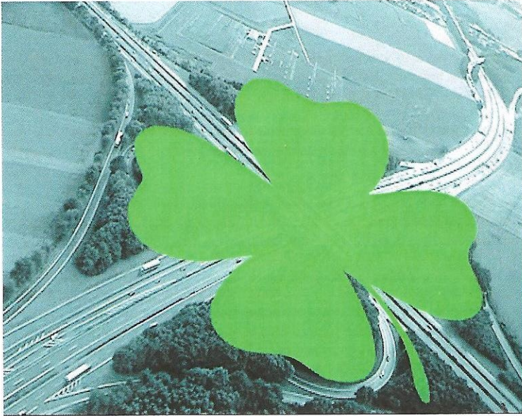
Moving Germany, A social sculpture project

Beginning in the mid-1960's, European and American artists extended the meaning of sculpture as art. Going beyond the traditional notion of what sculpture is - in respect to its materials, its techniques, its practices and its space - they created new conditions and opened up a debate on wider issues, which is recorded in their many-sided experimentation, their subversive and pioneering propositions.